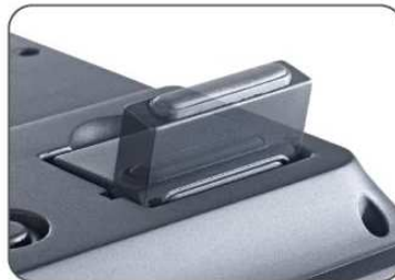
Two Height Settings